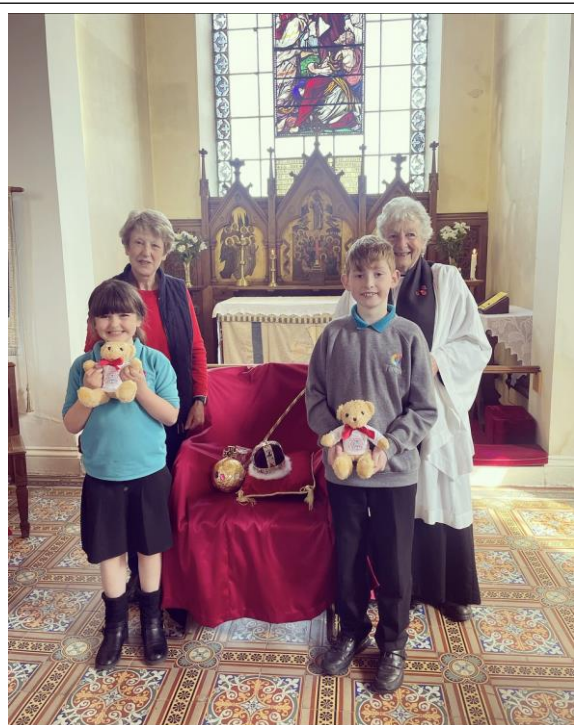
Tilstock pupils and their Coronation Teddy Bears!