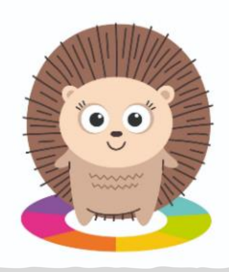
The Tilstock Pledge – EYFS Building character and developing cultural capital for our children